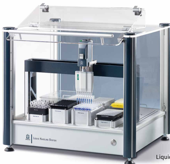
Liquid Handling Station