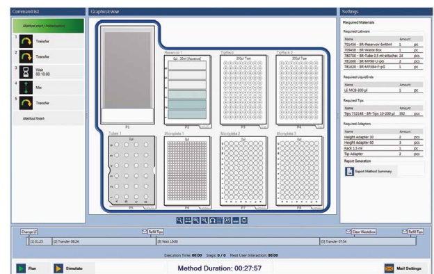
Figure 2 The virtual deck of the software of the Liquid Handling Station looks like the real worktable.

After the program is written, checking the efficiency and accuracy of the new protocol can be done with the simulate feature. This allows the user to catch mistakes before utilizing samples and consumables on an errant program. One of the most helpful features incorporated into the dilution program was being able to add a pause into the protocol. The pause was added with an instruction to wash and add the ELISA plate to the appropriate deck position. This way, the ELISA plate did not sit on the deck dry after being washed, waiting for the robot to dilute the samples.