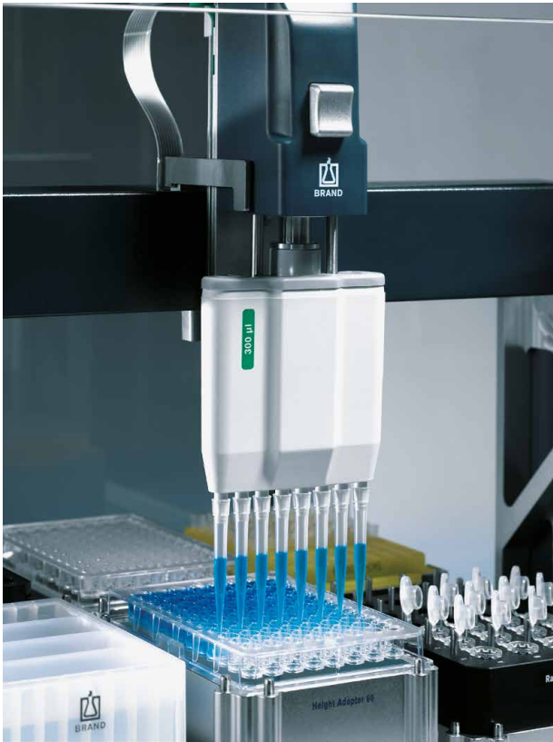
Figure 1 Liquid Handling Station using the 20-300 µl 8-channel Liquid End.

The LHS was used to prepare ELISA plates, while in parallel ELISA plates were also prepared by a technician for comparison of results. In this application, the LHS coated ELISA plates with 100 µl/well by multi-dispense pipetting pre-diluted coating solutions from 2 ml microcentrifuge tubes using the 1 ml single channel Liquid End (LE). The robot was able to dispense 10 wells with 1 aspiration. Conversely, a technician coated ELISA plates using a manual hand-held 50-300 µl multichannel pipette.